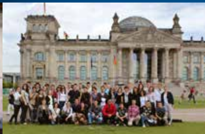
Third party funded projects